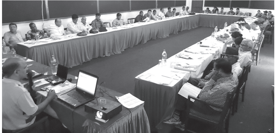
Media owners and professional organizations participating in a dialogue on journalist safety protocol in Biratnagar on July 30

Similarly, in the level of policies and practices, the following were suggested: