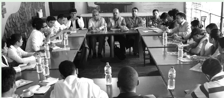
Stakeholders discussing RTI and management of crisis information

Nepal witnessed a huge loss of lives and destruction of properties in the recent earthquakes – the major one striking the