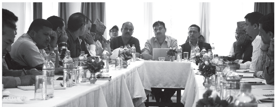
Lawmakers and FOE practitioners discussing correction on draft constitution in Kathmandu on July 31